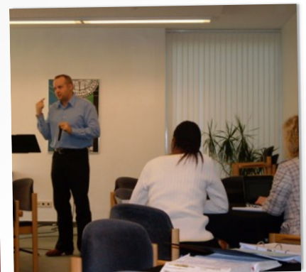
TEACHING AT RBTC!