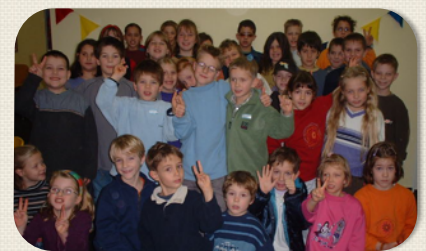
KIDS IN 2001