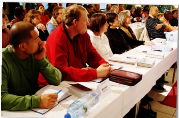
BIBLE TRAINING CENTER (ONGOING)

And when we cooperate with the Holy Spirit, it's ALWAYS VICTORY! (II Cor 2:14)