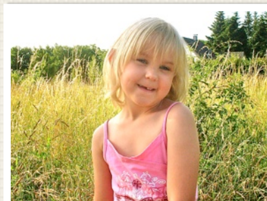
JOY (5 YEARS)