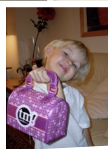
Our little "make-up" queen