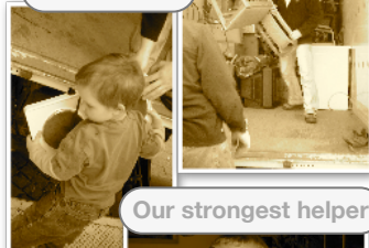
Our strongest helper