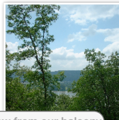
View from our balcony