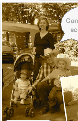
Come visit us sometime!