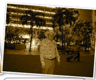
Raising Support in Florida