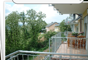
Neighbors to the right